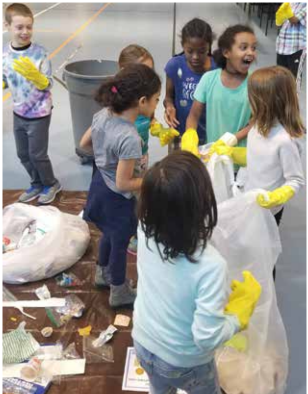
Photo of students at Hearst Elementary School

It may seem gross, but students really enjoy deconstructing and analyzing their lunchroom waste through the ANS "Garbology" program! Knowing that Americans produce over 250 million tons of trash every year, we created this program to allow students to delve deeper into the "science of garbage" and conduct their own hands-on investigations of composting, recycling, and litter at their schools. ANS staff also work closely with school teachers, administrators, and building services staff to improve school waste management practices through this program. ANS has delivered Garbology to DC schools since 2017, and we were recently awarded a new two-year Environmental Literacy Advancement Grant from the Office of the State Superintendent of Education (OSSE) to deliver this fun, investigative program to students at 24 elementary schools across the District during the 2019-2020 and 2020-2021 school years.