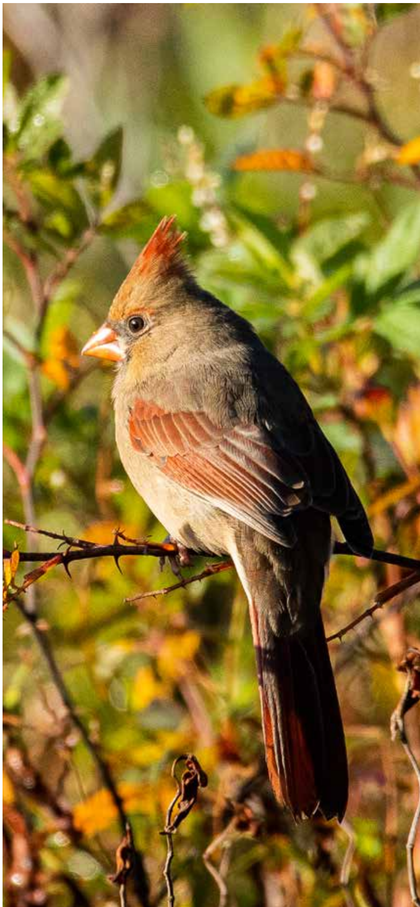
Female cardinal by Jane Gamble