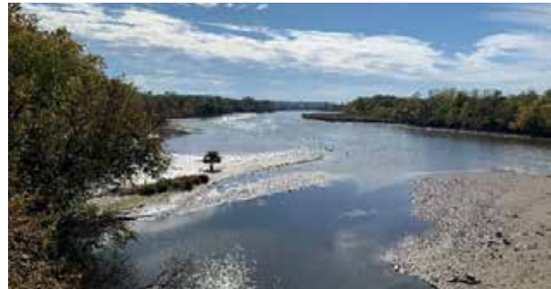
The Anacostia River in October. Taken while ANS was on a walk with partners to discuss equitable access to the river.

ANS is Fighting for the Environment in DC's Budget: ANS is expanding its organizational capacity to engage with the DC Council on funding environmental programs in the District. As the budget season approaches, ANS is gathering support for key environmental priorities and meeting with staff from councilmembers' offices.