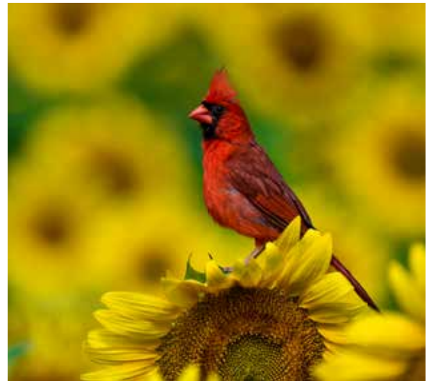
Photo of Northern Cardinal at McKee-Beshers

Female music collective Madre Tierra will join ANS to celebrate Hispanic Heritage Month with an evening of Bomba y Plena music, rooted in African traditions and the natural landscape of Puerto Rico. Por favor join us for what promises to be a beautiful, rhythmic, celebratory, and resilient evening of singing, laughing, and dancing!