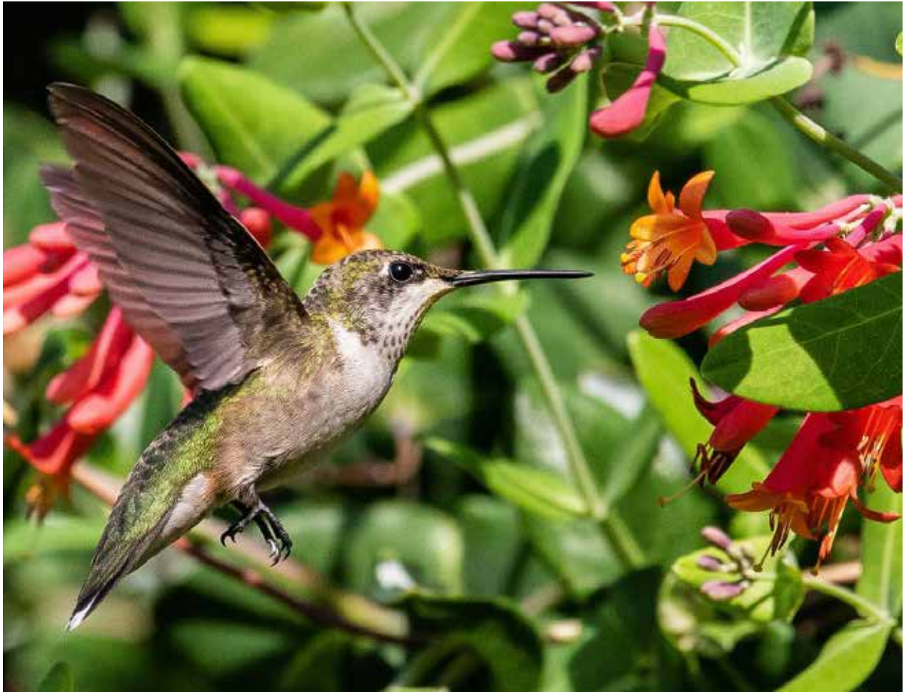
Ruby-throated Hummingbird at Green Spring Garden