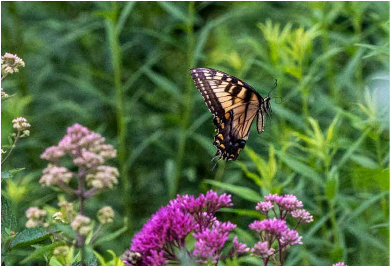
Eastern Tiger Swallowtail in the Blair Native Plant Garden by Ben Israel

Proudly printed on 30% post-consumer waste paper. Please recycle this paper.