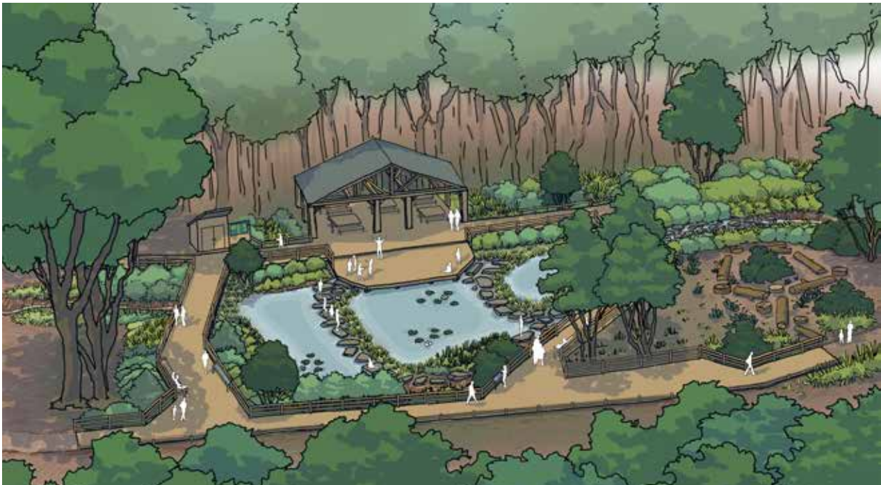
Accessible Nature Trail for All: Artist's Rendering of Restored Pond, Boardwalk, and new Pavilion

Yes, we think we can restore this little stream to something of a magnificent thing, and with your support of our Nature for All Campaign, we are sure we will.